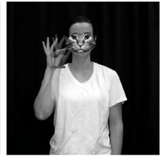
ASL cat (part)

LANGUAGE IN MIND 2e, Figure 5.3 © 2019 Oxford University Press