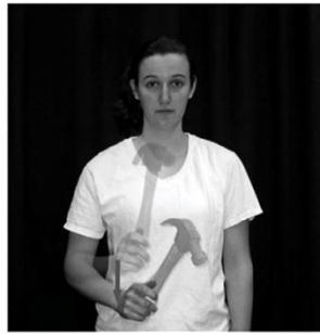
ASL hammer (handling)

If you miss the final exam, you must apply to write a deferred exam (with appropriate documentation) to the Registrar's Office within the time period specified in the current Undergraduate Calendar.