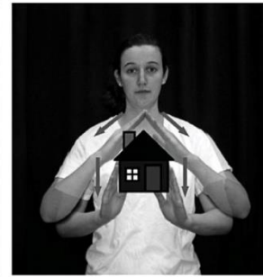
ASL house (shape)